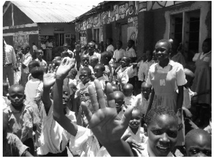
Above: A Welcome from the Children at Katwe.

Tim's report runs three more pages so unfortunately we must limit it to just three pictures: